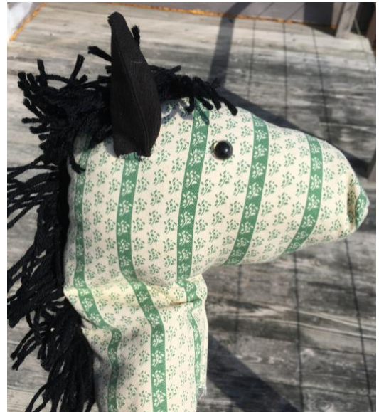
Figure 2: A color-coordinated hobby horse crafted by one of Myrkfaelinn's youth.