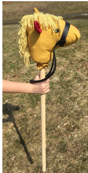
Figure 1: The hobby horse displayed at Ice Dragon 2018, made of all period materials.